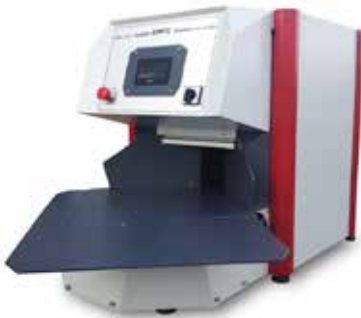
Version with table 50X70 cm